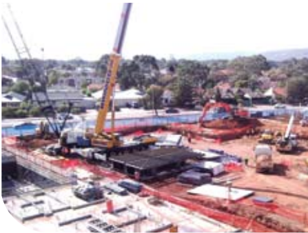
Earthworks, May 2010

The contractor, Candetti Constructions Pty Ltd began construction in October 2009 and the development is on schedule for the facilities to open in early 2011.