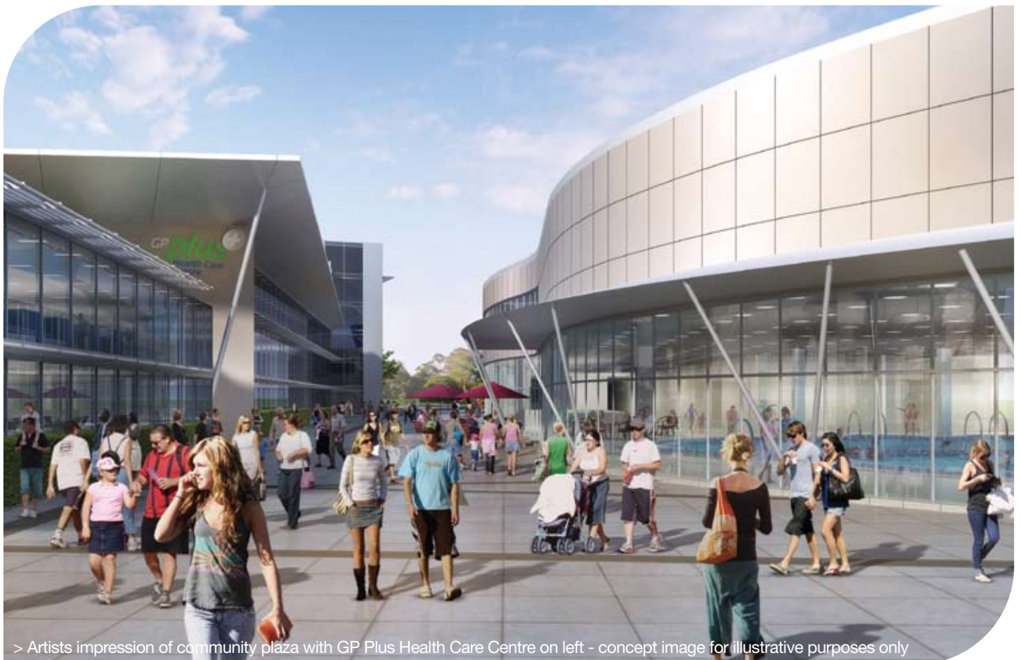
> Artists impression of community plaza with GP Plus Health Care Centre on left - concept image for illustrative purposes only