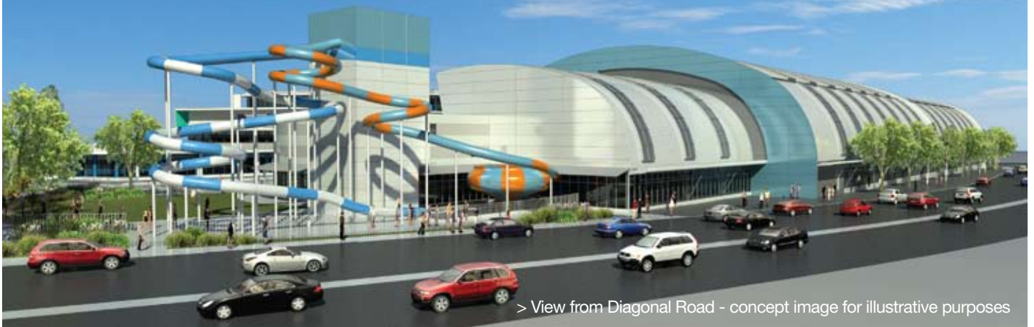
> View from Diagonal Road - concept image for illustrative purposes