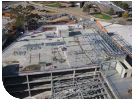
GP Plus construction, July 2010