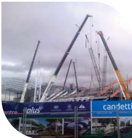
View from Morphet / Diagonal Road corner, August 2010