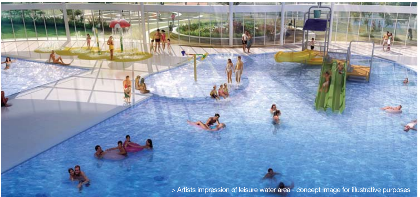
> Artists impression of leisure water area - concept image for illustrative purposes