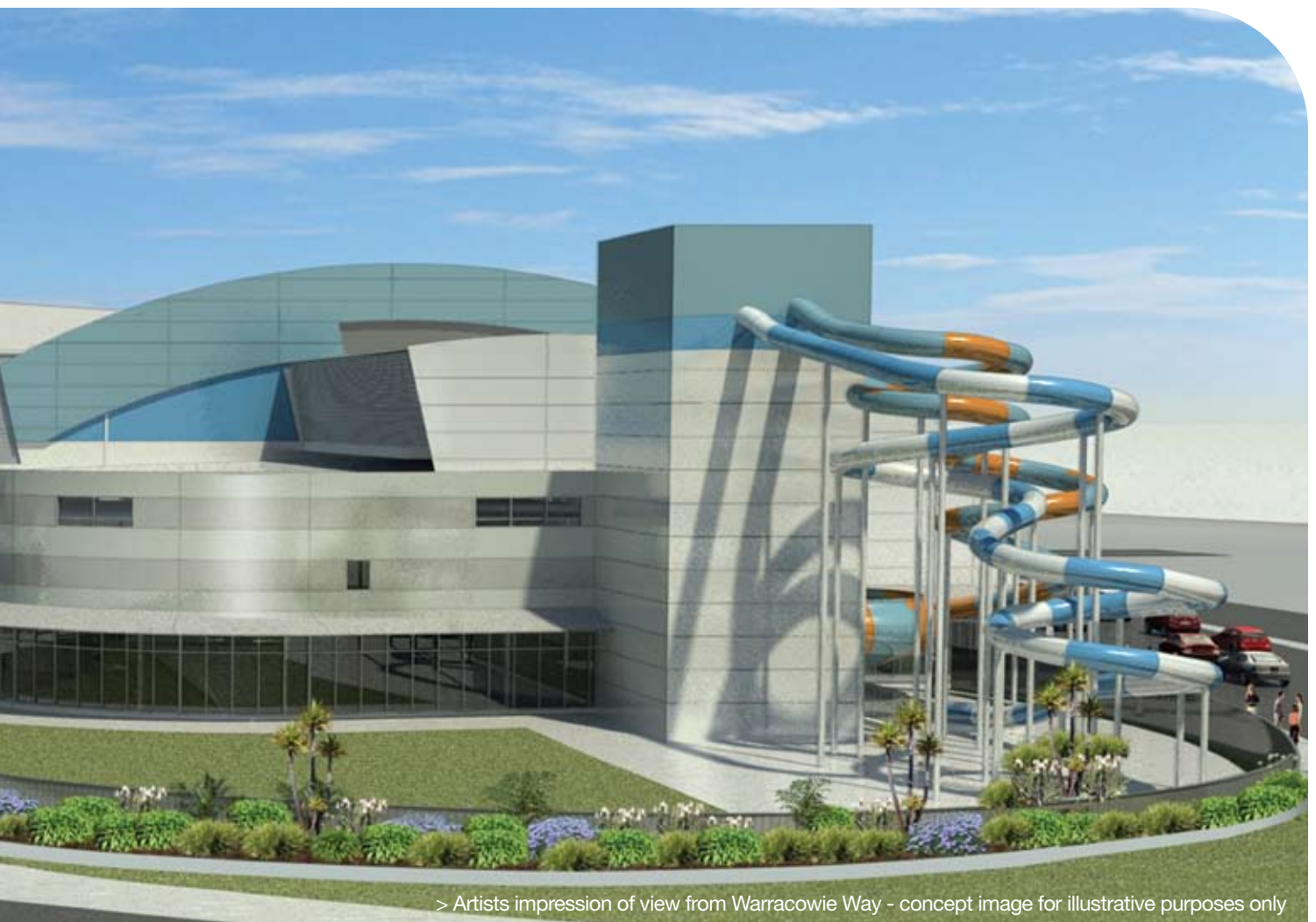
> Artists impression of view from Warracowie Way - concept image for illustrative purposes only