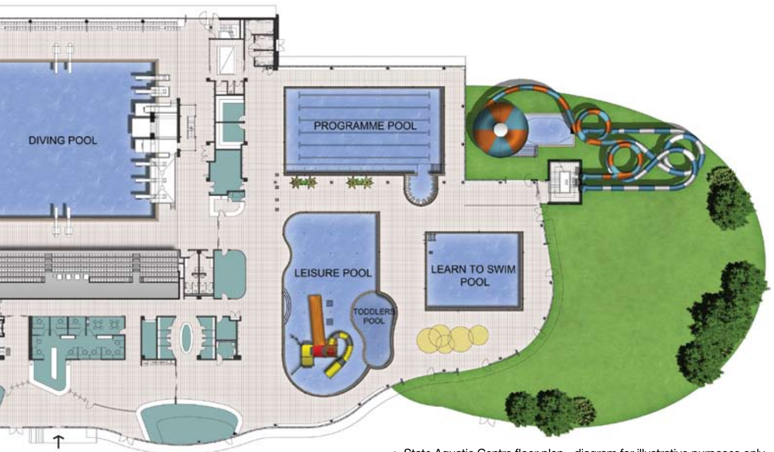
> State Aquatic Centre floor plan - diagram for illustrative purposes only

In addition, the GP Plus Health Care Centre is designed to achieve a 5 Star Green Star Office Design rating through energy efficiency, water efficiency and material recycling.