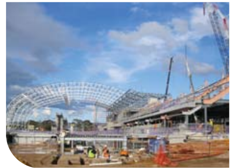
State Aquatic Centre construction, August 2010