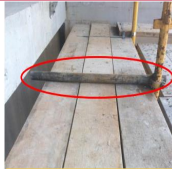
Support Tube, which had been removed by scaffolder