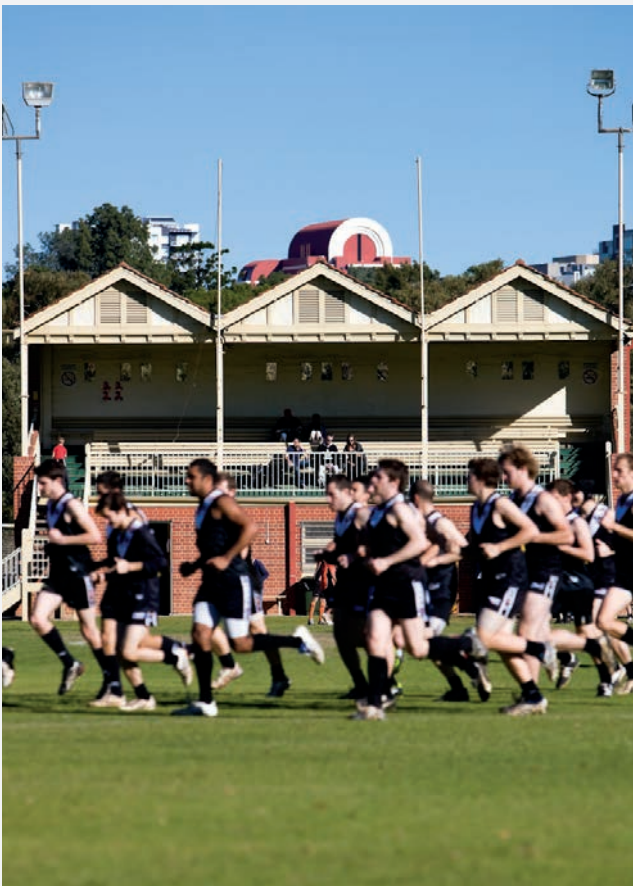
University Oval, Adelaide

Community infrastructure brings people together, strengthens community capacity, builds community resilience and enhances community cohesion.