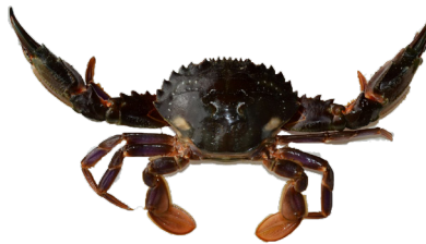
Asian Paddle Crab

Due to its colouring and size, it is possible to confuse the Asian Paddle Crab with native crabs. The images below show common native crabs and their colouring.