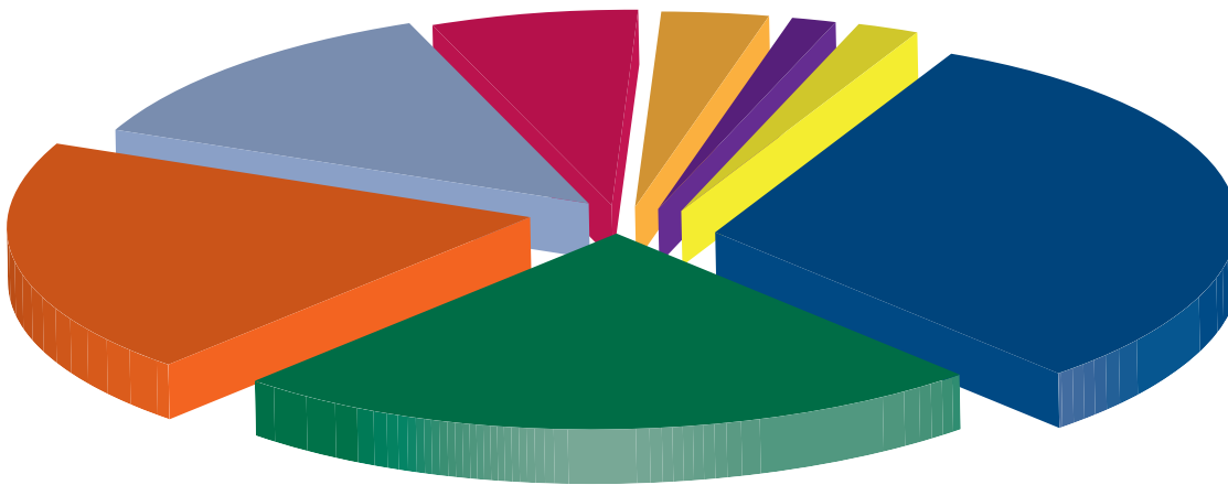
State Entitlements: Total Commonwealth Financial Assistance Grant Funding for Local Government 2018-19 proportion as a percent of total funding distributed

In 2018-19, there were 68 councils, the Outback Communities Authority and five Aboriginal communities eligible for grants in South Australia.