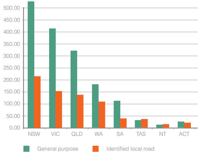
Summary of Grants for 2018-19: Based on Final Estimates – July 2018

Projects may be funded out of each of these pools of funding or a combination of both pools and grants are tied for a specific project.