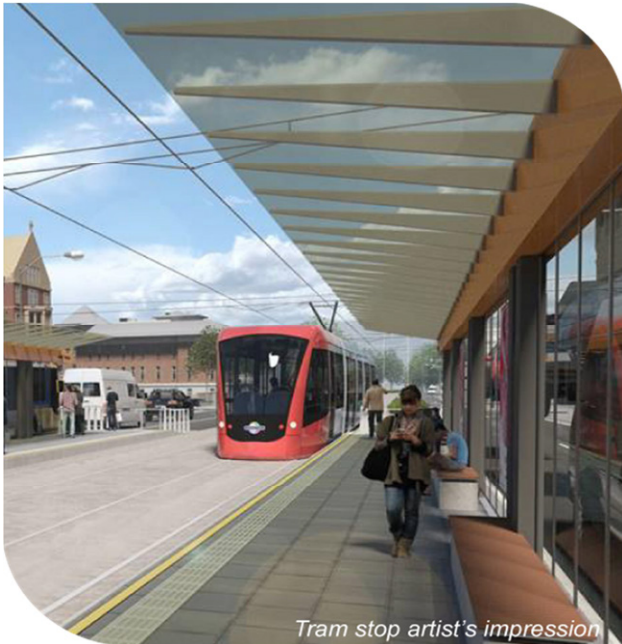
Tram stop artist's impression

This newsletter provides an update on Stage 3 – King William Road.