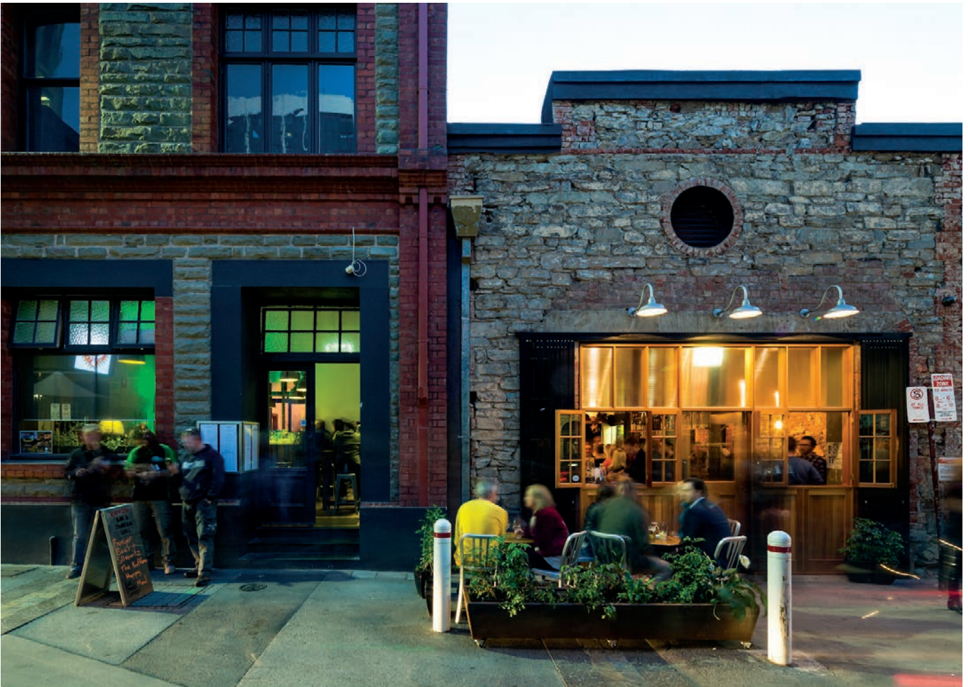
Peel Street, Adelaide

Adaptive reuse of heritage places also contributes to substantial environmental and financial savings in embodied energy by avoiding the creation of waste and the need to create more building materials. It also provides opportunities to assist local economies through employment and tourism and ensures that historic buildings continue to provide a sense of place for current and future generations.