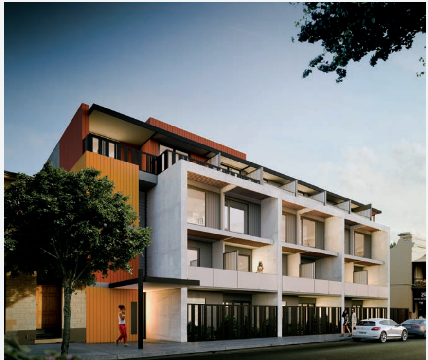
Artistic impression: Wharf 10, Port Adelaide

The design technique connects Dock 10 to the cultural and historical identity of its location. By homogenising the module formation of the facade, relief is given to the surrounding heritage buildings.