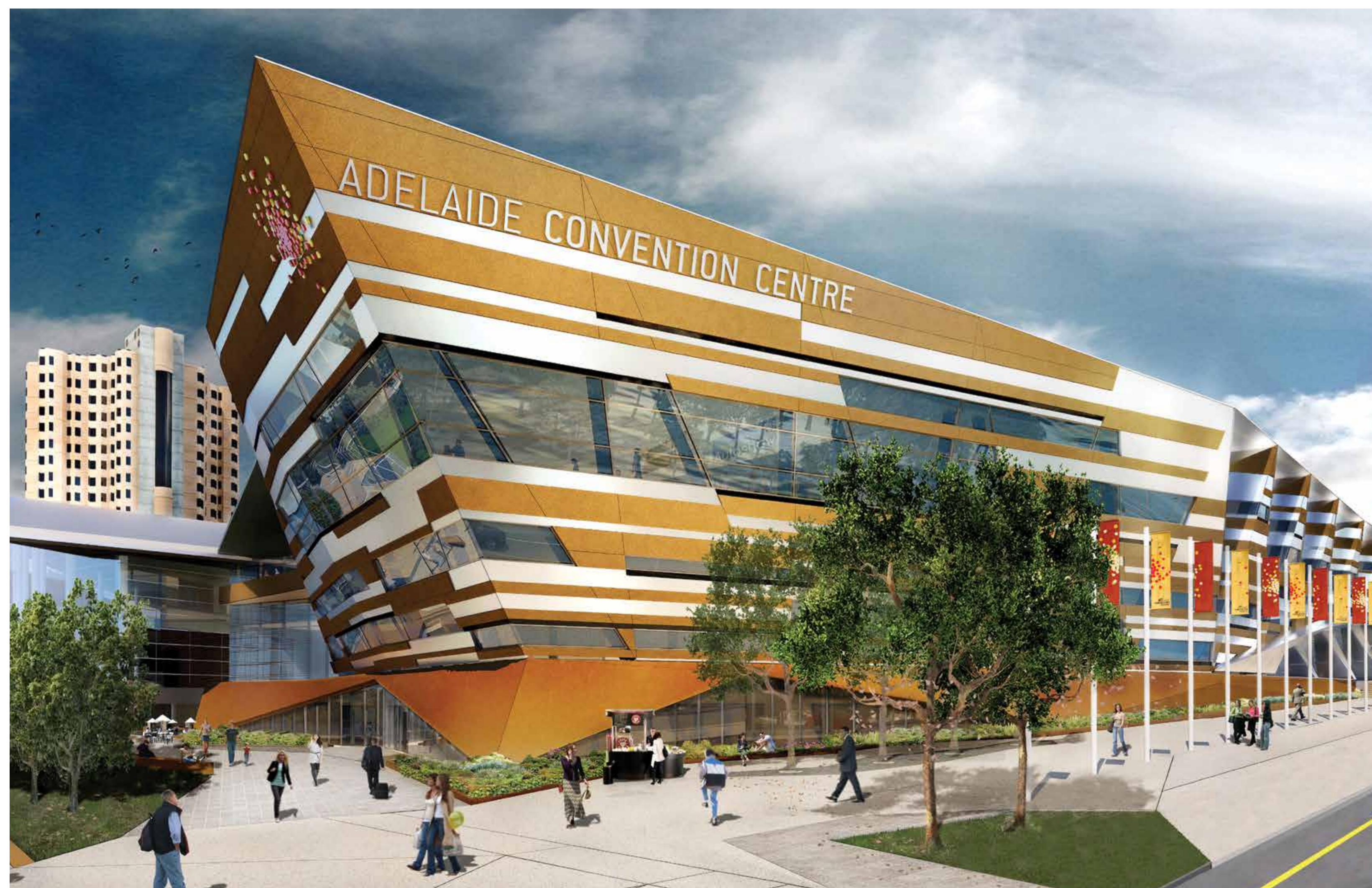
Artist's Impression of Stage 1 expansion.

The first building (Stage 1) expands the existing facility westwards over the railway line to link with Montefiore Bridge. The second building (Stage 2) will replace the current plenary hall with a new multi-purpose facility.