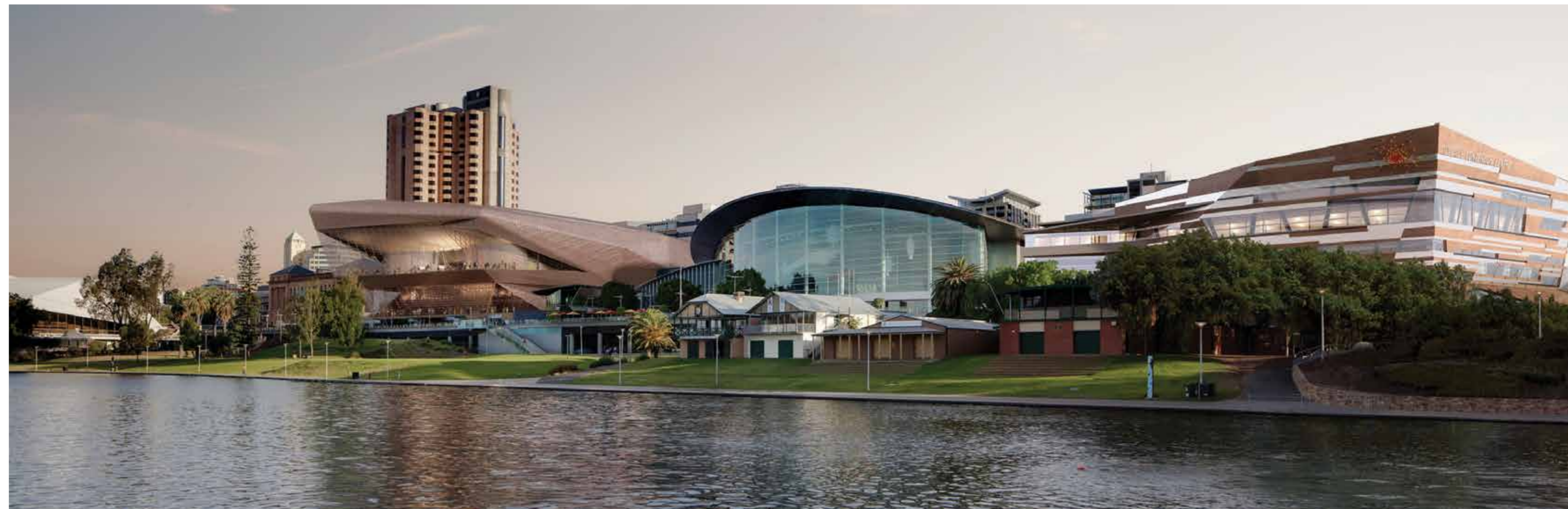
Artist's Impression of Stage 1 and Stage 2 of redevelopment with existing facility.

The project is being delivered by a multi-disciplinary consortium including Woods Bagot (architects), Lend Lease (construction), Aurecon (structural and rail engineering), Bestec (mechanical and electrical engineering) and Thinc Projects (project management).