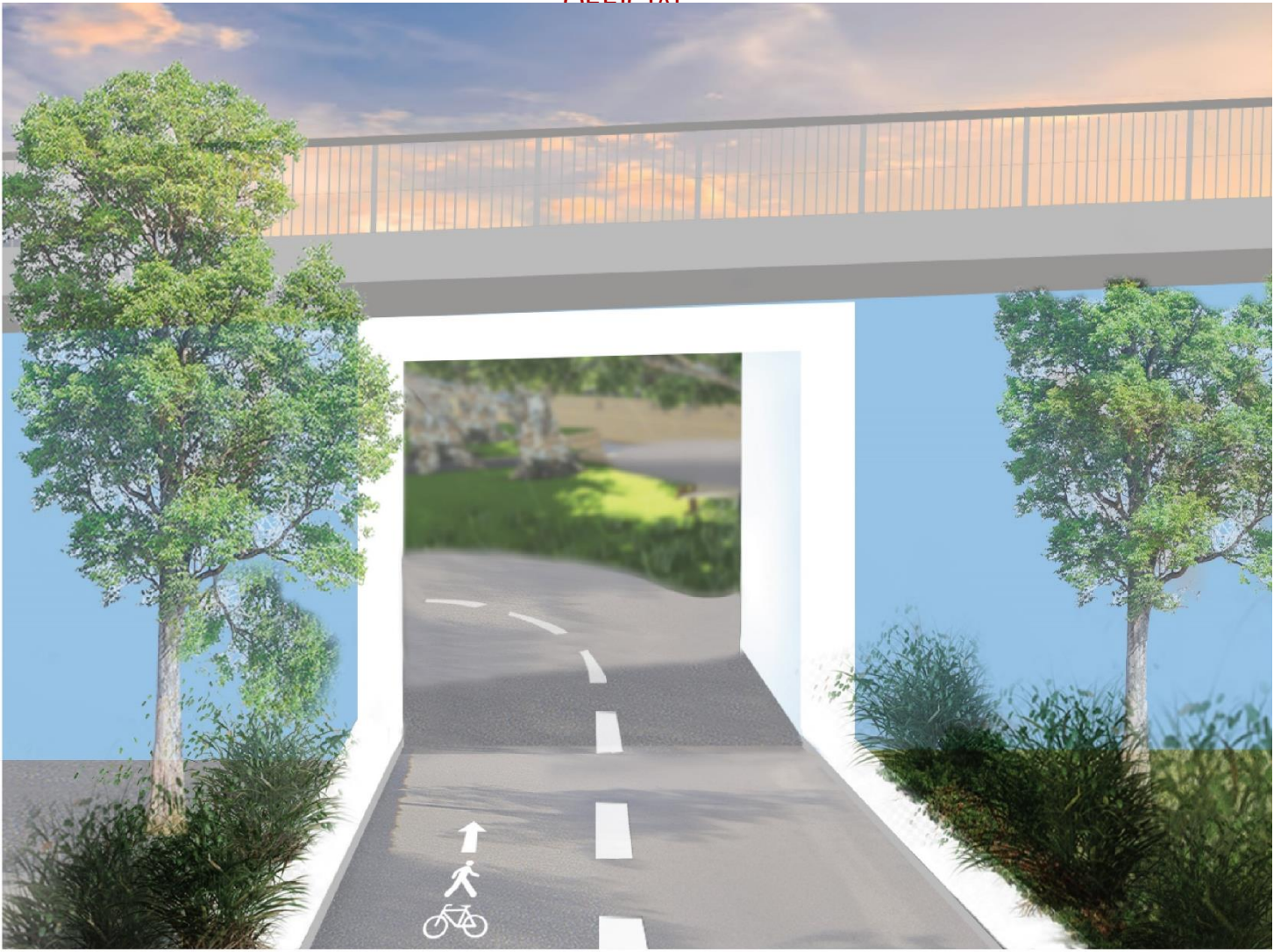
Planned local upgrades Artist impression of widening