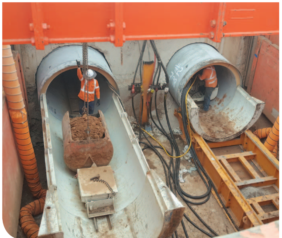
Pipe-jacking works at the northern end of the project site. Two 1800mm diameter pipes being installed underneath South Road to carry stormwater.