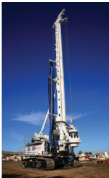
CFA piling rig

Piling works will also be undertaken on the eastern side of Main South Road from Flinders Drive to Riverside Drive from early 2017.