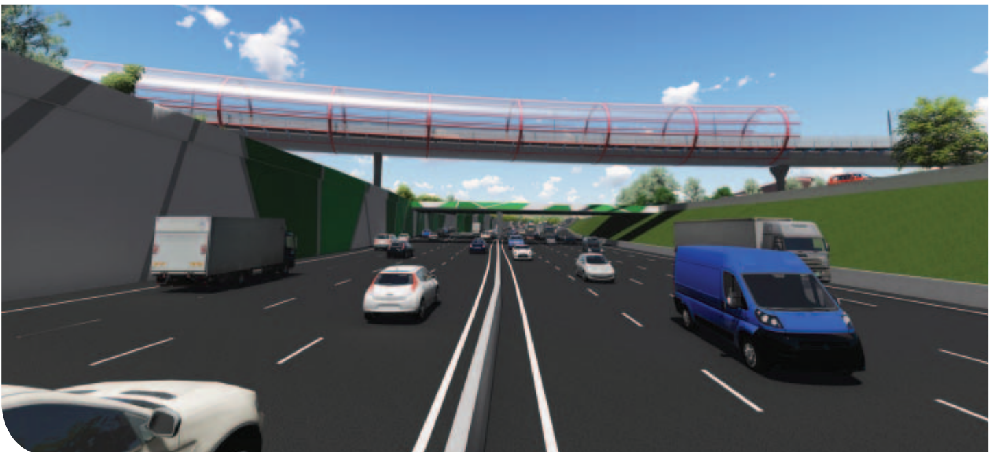
Artist's impression of Main South Road intersection with Flinders Drive

The project also supports equitable access to information. Translation of project information can be provided upon request.