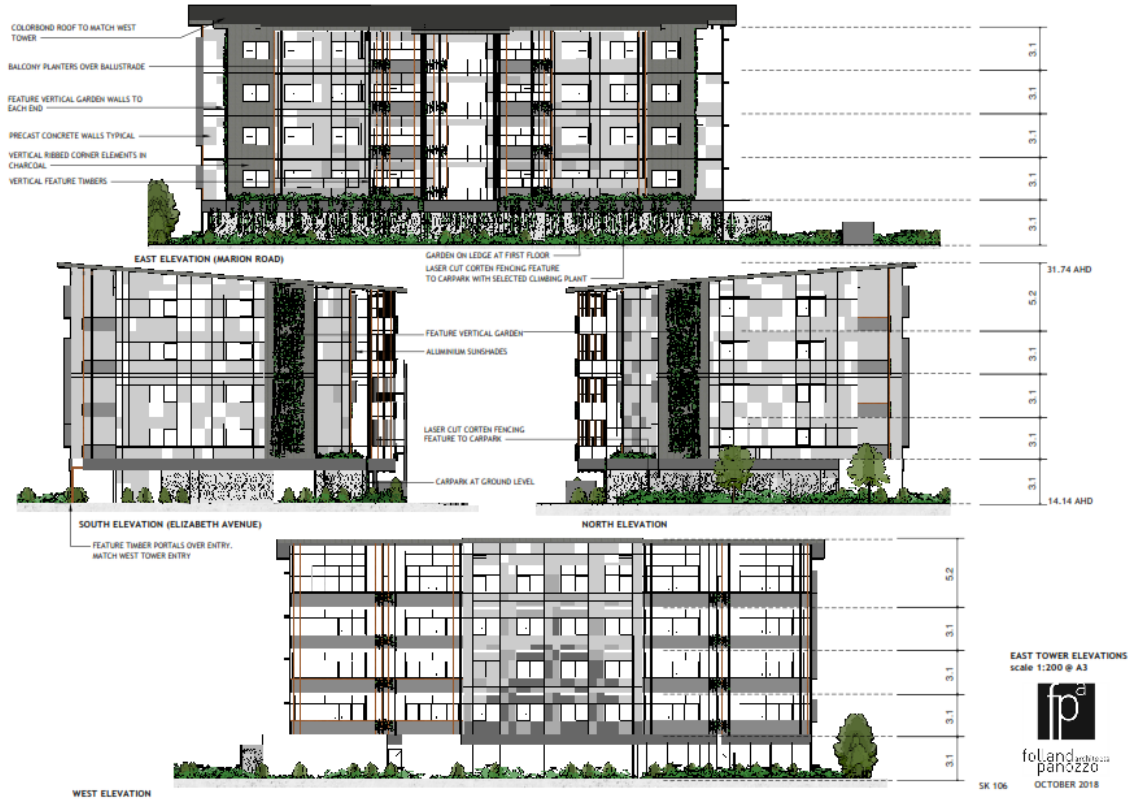
Image 5: Proposed elevations of Stage 2 – East tower maximum 31.74m AHD (November 2018)