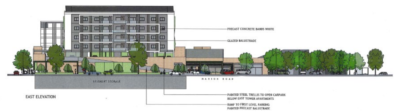
Image 3: Approved eastern (Marion Road) frontage schematic (June 2018)