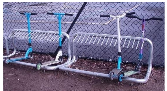
Dedicated scooter racks