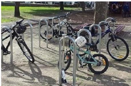
Individual rails. 1 or 2 bikes per rail