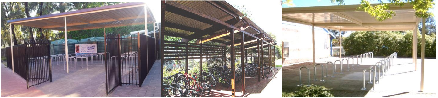
Examples of shelter and fencing options.