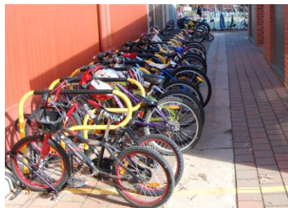
A set of rails (racks)