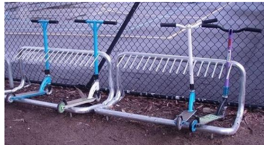
Dedicated scooter racks