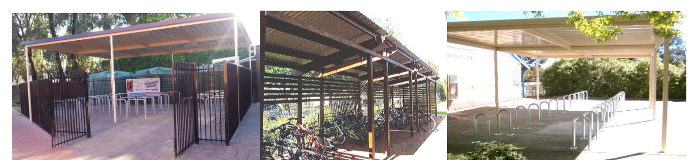
Examples of shelter and fencing options.