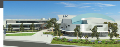
State Aquatic Centre