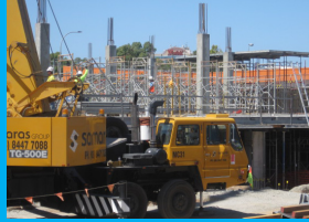
GP Plus - Suspended Slab

As part of Candetti's on going aim to keep local residents and businesses informed of what is happening on the domain site Candetti has held Information Sessions on site for directly adjacent residents and business owners.